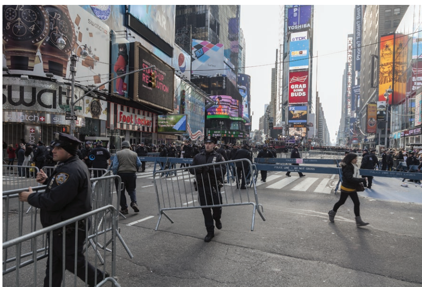
FIGURE 1 PREPARING FOR NEW YEAR CELEBRATIONS IN TIMES SQUARE

Following the Washington Post analysis of New Year in Times